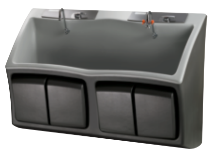
Streamline 2-bay scrub station with standard rose spray heads and optional eye wash station