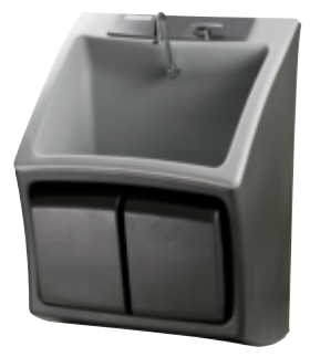
Streamline single-bay scrub station