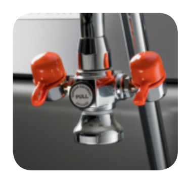
Standard rose spray head with optional eye wash