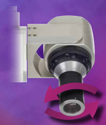
Rotate – spin the image around to get the best view