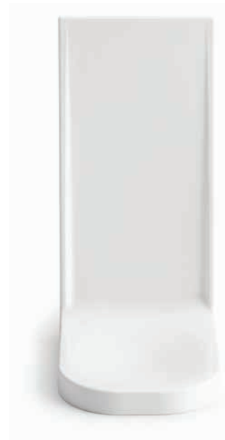
T384-Q5 Optional splashguard 24/case