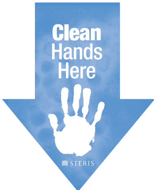
“Stop the Spread” Wall Arrow EQ1930, Pack of 50, 6.5” X 8”