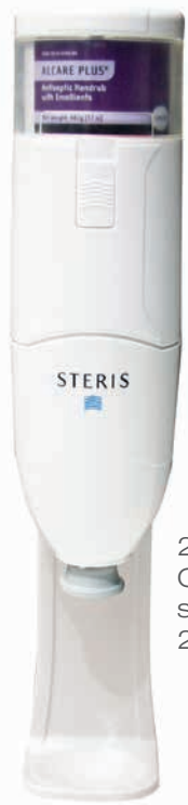
9 oz 2D43-Q7 (24/case)

Dispenser for foamed waterless sanitizers. 9oz and 17oz sizes available.