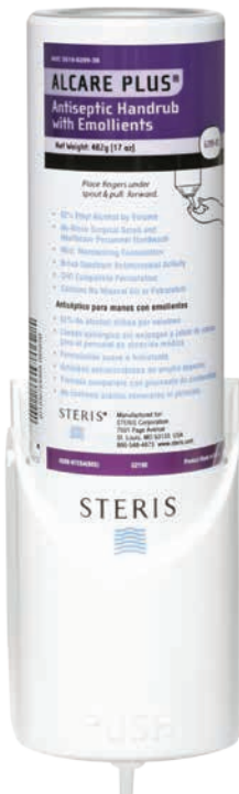
17 oz T516-Q5