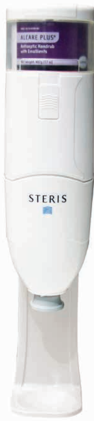
17 oz 2D53-Q7 (12/case)