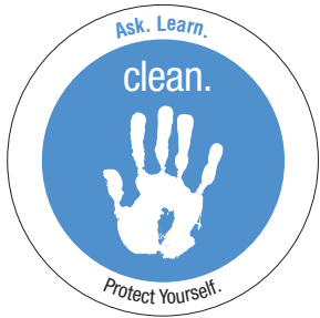
2" Sticker EQ1772 PACK OF 100