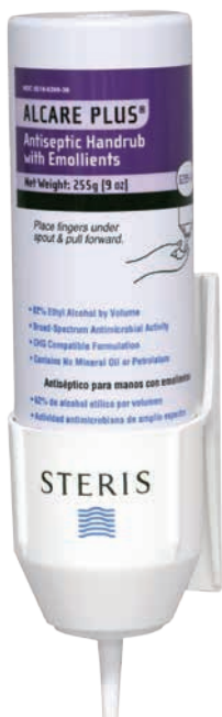
9 oz T603-Q7

Wall bracket dispenser for foamed waterless sanitizers. 9oz and 17oz sizes available.