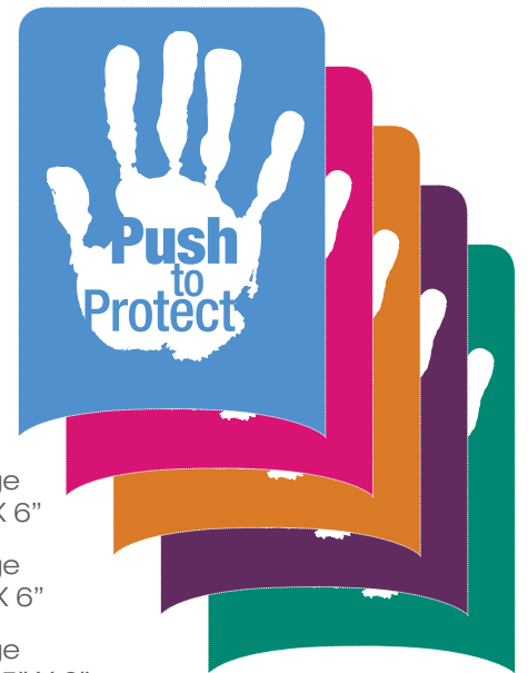
“Push to Protect” Wall Signage Blue EQ1931, Pack of 50, 5” X 6”