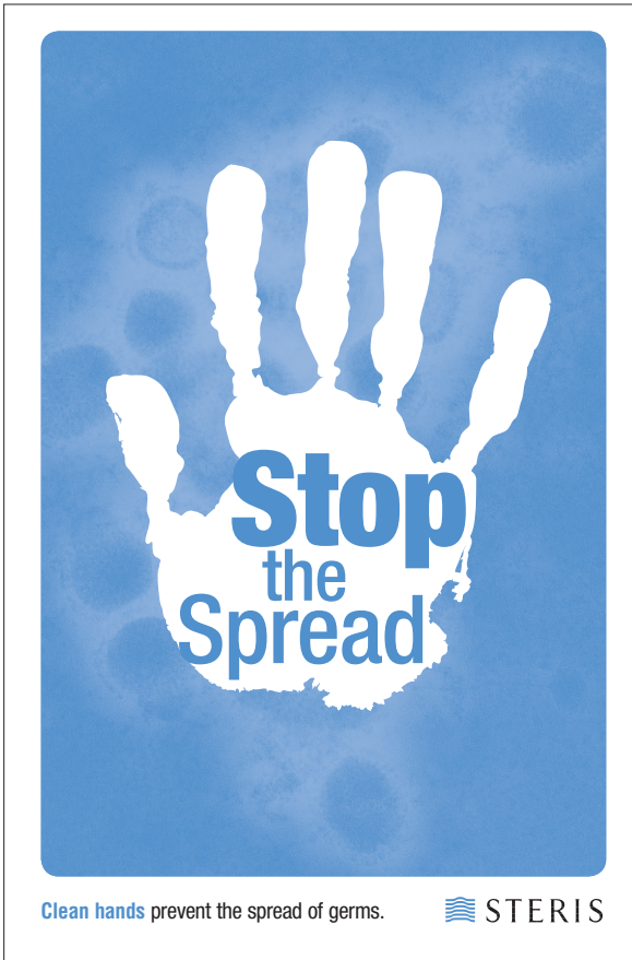
“Stop the Spread” Posters EQ1920, Pack of 25, 11” X 17”