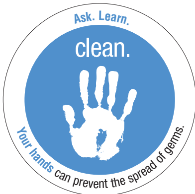
5" Cling-On EQ1774 PACK OF 50